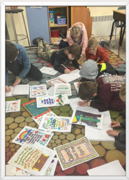
Writing out their favorite verses