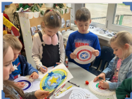
The long awaited MARVEL party