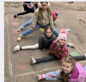
Recess twister fun