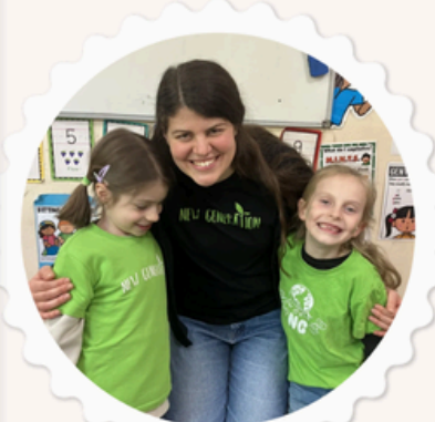
Two sweet students