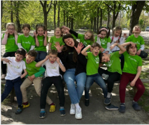
My SWEET and CRAZY 2 nd graders!